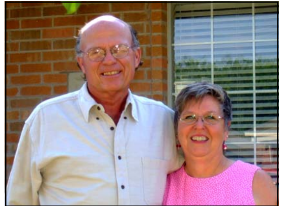
In June we attended a wedding in Dallas where we visited with six couples we had known in college. Some have been life-long friends. Others we had not seen for 35 years! Amazing!

Check out our new web site at: www.mounthorebministries.com