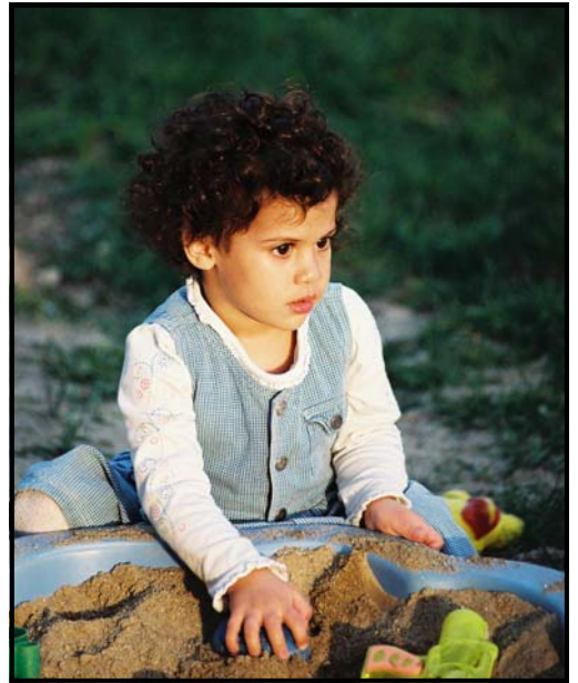
One of the children playing in the yard at the Family Center.